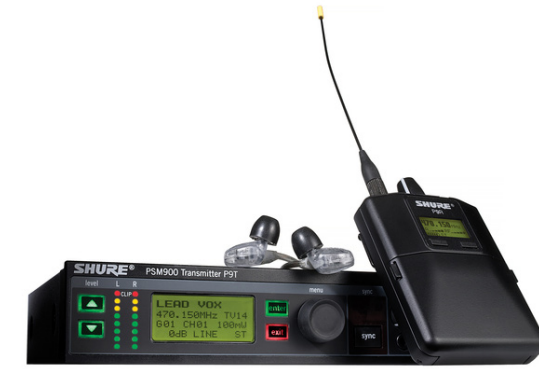
7. In-Ear Monitor System