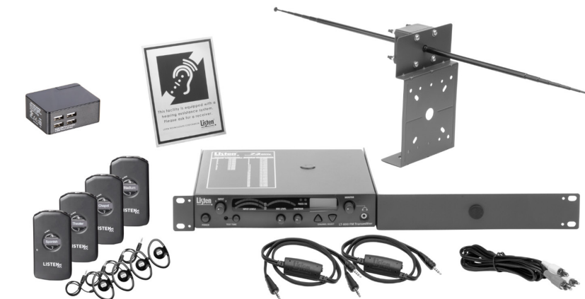
8. Hearing Assist System