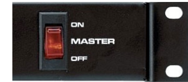
2. SSR-200 Power/Signal Switches