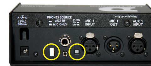
5c/d. PHONES SOURCE & PHTM Switches