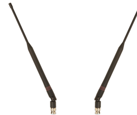
4c. Proper Antenna Angle