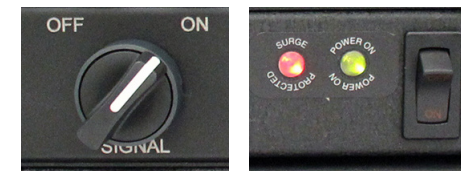
2. SSR-100 Power/Signal Switches

Products Involved: All standard Sportsound systems