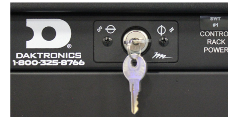
2. SSR-300 Power Key Switch