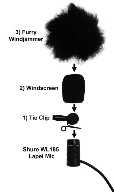
4d. Windscreen Installation